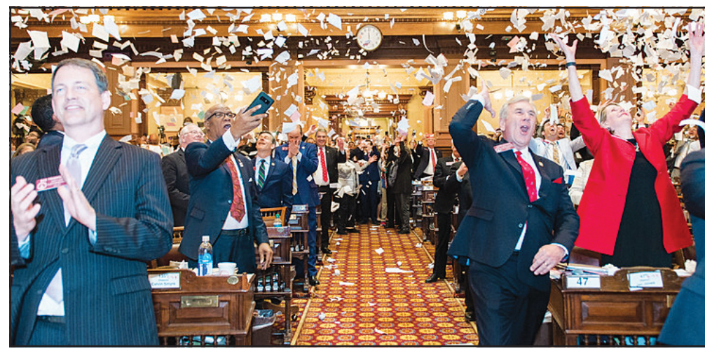
Georgia lawmakers celebrating the end of Sine Die, the 40th and last day of the 2019 Legislative